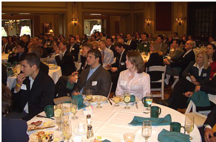
Roundtable members pack the ballroom at Kenwood Country Club

Check out pages two and three inside for an in-depth look at the program calendar highlighting the Roundtable series. To become a member, just complete the attached envelope and return with payment.