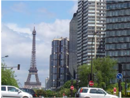
(View of the tower from the work place)