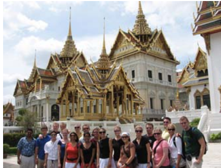
(Group of students outside the Grand Palace.)

home of the famed Emerald Buddha which was much smaller than I had expected and is actually made from jade. Chulalongkorn (Chula) University was also very picturesque and on our campus tour we learned that the university was founded in 1917 by King Rama V and is the largest university in Thailand. The classes that we took at Chula ranged from "How to Market in Thailand" to anti-globalization views from a NGO known as Focus on the Global South. Though we were being introduced to views and topics very unfamiliar to us, we really felt that we were truly broadening our perspectives, learning, and realizing how other people might think differently from us.