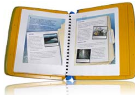
(Book with TUI technology)

"With our development tools and integration support, publishers and content providers can easily create a new genre of interactive, technology-based texts and supplements," said Barkeloo. "The TouchBook™, with its TUI technology, integrates easily into current product development systems and applications." The company is not restricted to the education realm, but instead it is open to the entire publishing arena.