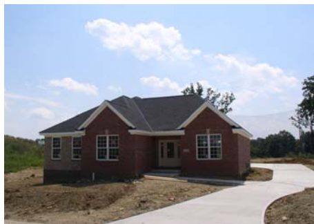
(2400 square feet, 3 bedrooms, 2.5 bathrooms, study, 3 car garage, golf course views.)