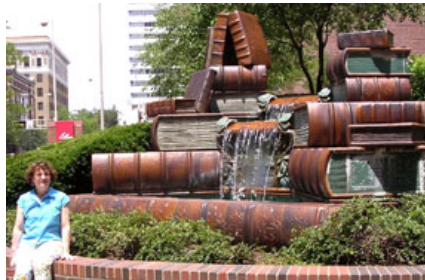
(Book fountain outside Library)