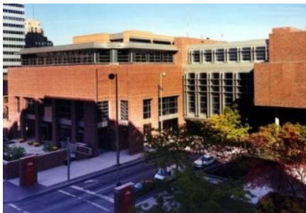
(Cincinnati & Hamilton County Public Library, Downtown Cincinnati)

For anyone who would like to earn (or needs to earn) more community service hours, the 33rd Annual Used Books Sale for the Friends of the Public Library is coming up on Fountain Square.