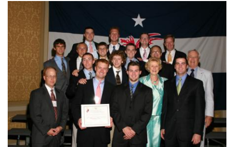
(Betas after winning the Francis H. Sisson Award at the General Convention, August 2004)