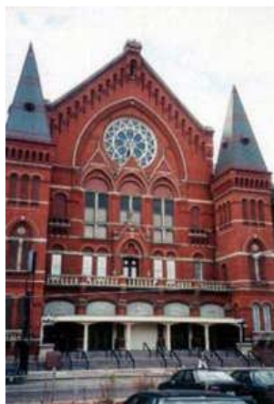
Cincinnati Music Hall

The Lindner Honors-PLUS students and staff were honored to be included with American Financial at the Lindner Holiday Party at Music Hall on December 8 th .