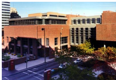
Cincinnati Public Library

I have two updates from The Friends of the Public Library of Cincinnati and Hamilton County .