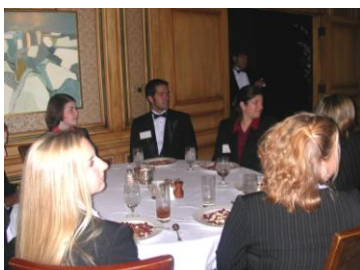
Dinner at the Maisonette