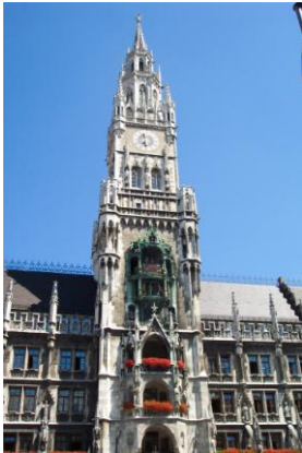
Glockenspiel on the Marienplatz

"There are two main features that make this experience extremely unique from any other study abroad..."