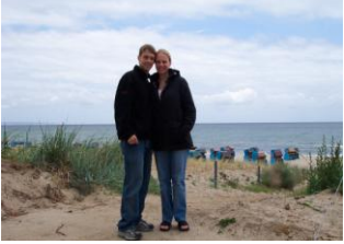
German beach on Ruegen Island (cold!!)

"I definitely believe the experience is worth the work."