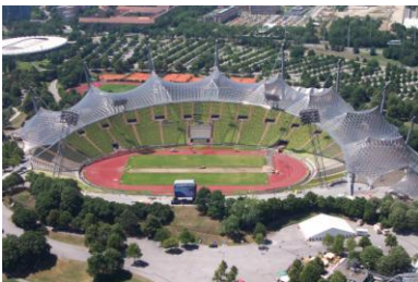
Olympic stadium from the Olympic tower

"There are two main features that make this experience extremely unique from any other study abroad..."